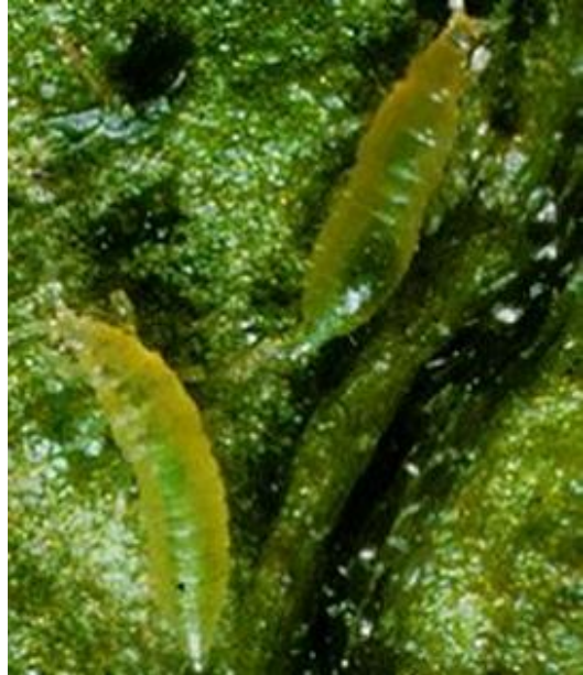
Melon Thrips Larvae