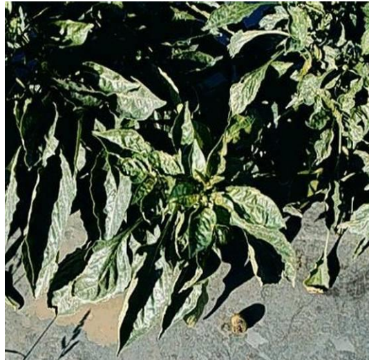
Melon Thrips Damage – Capsicum Plant