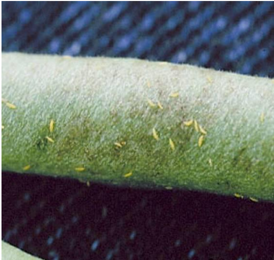
Melon Thrips on French Bean