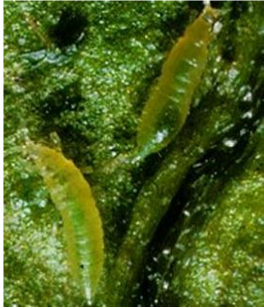
Melon Thrips Larvae