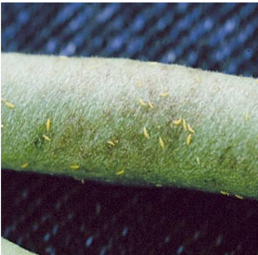
Melon Thrips on French Bean