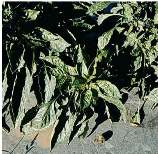
Melon Thrips Damage – Capsicum Plant