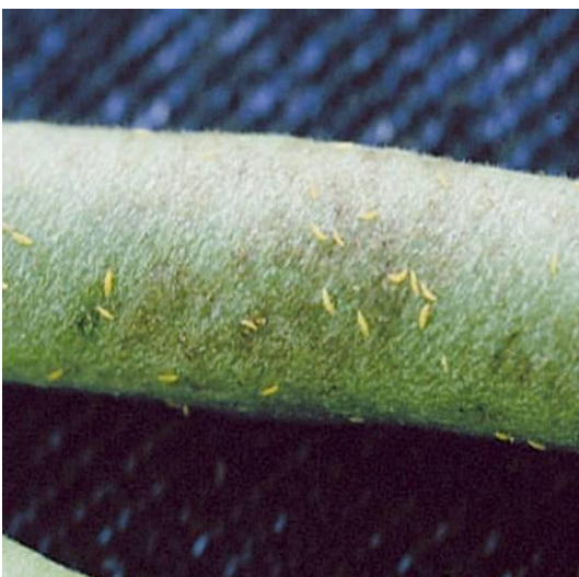
Melon Thrips on French Bean