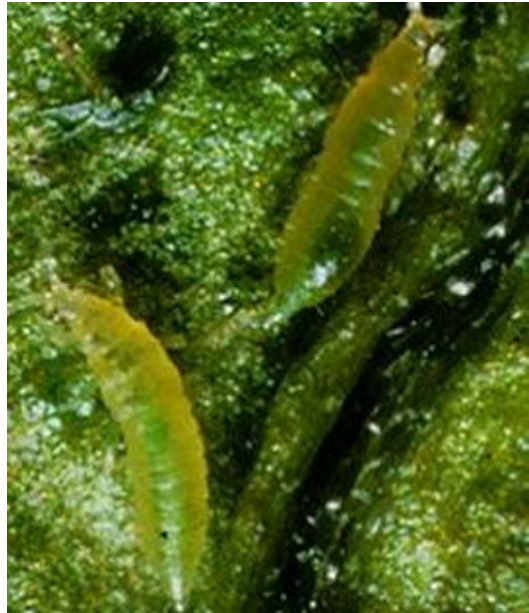
Melon Thrips Larvae