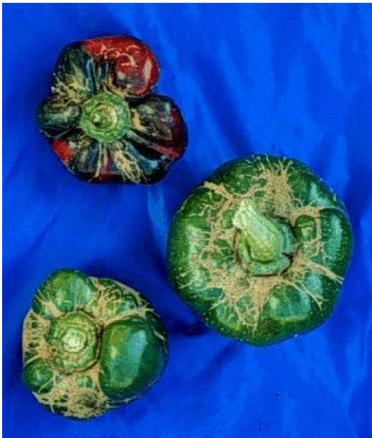
Melon Thrips Damage – Capsicum Fruit