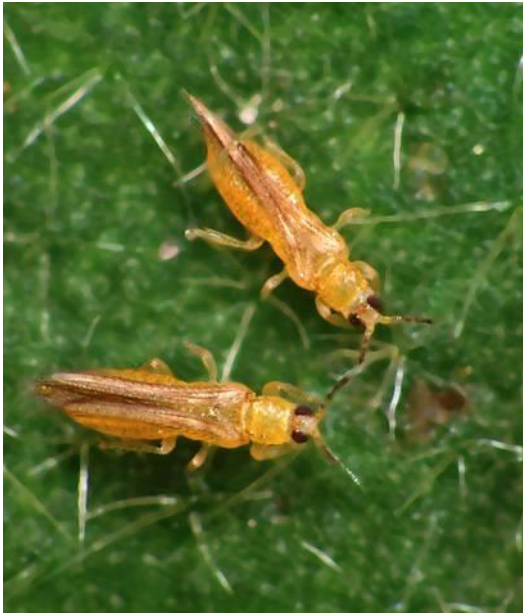
Adult Melon Thrips