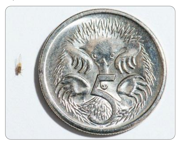
Mature adult psyllid in comparison to 5 cent piece. Note the small size of the insect and how the wings rest roof-like over the body

Stem death symptoms similar to other potato and tomato disorders.