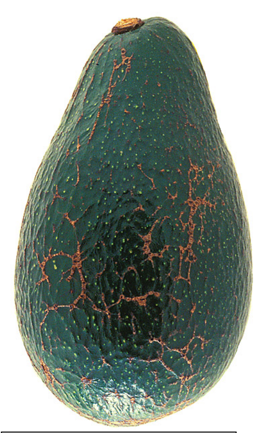
Above: Scattered blemish