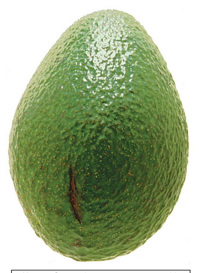
Above: Cuts and punctures not acceptable