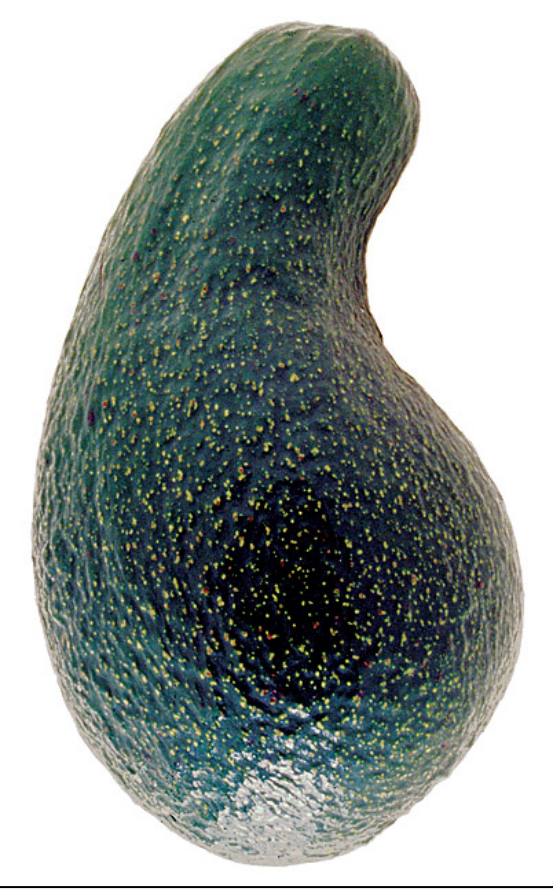
Above: Deformed fruit with no cracks or rots or stings