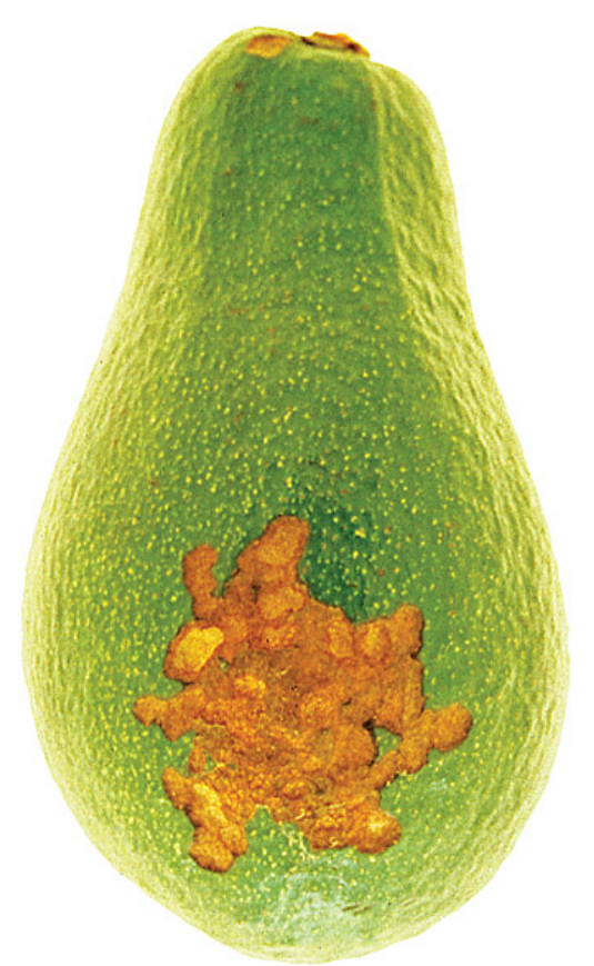
Above: Pest damage through to the flesh