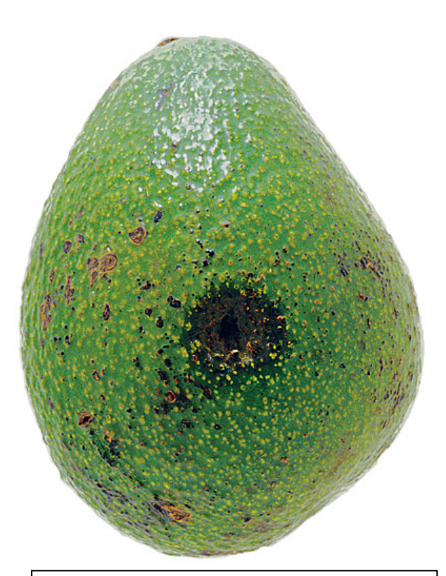
Above: Soft rots