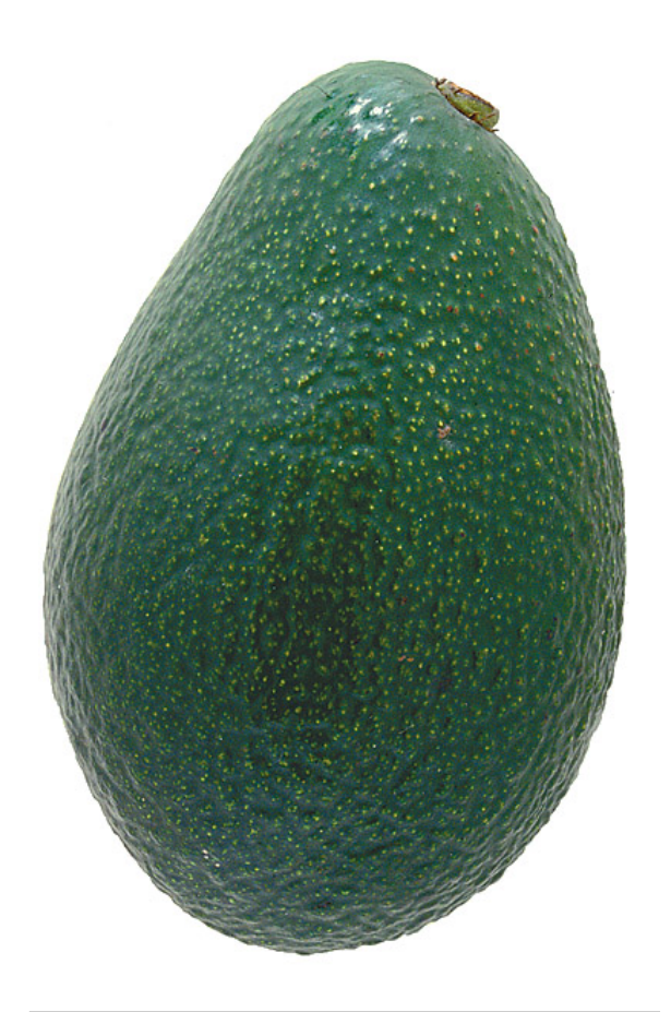
Above: Nil blemishes