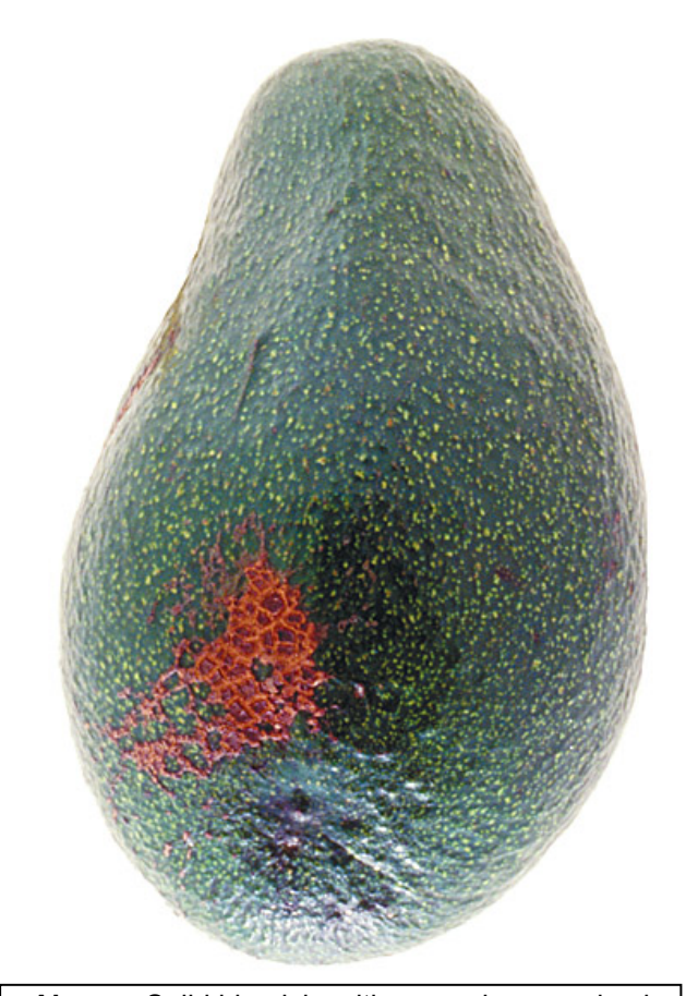
Above: Solid blemish, with no sunken or raised black blemishes