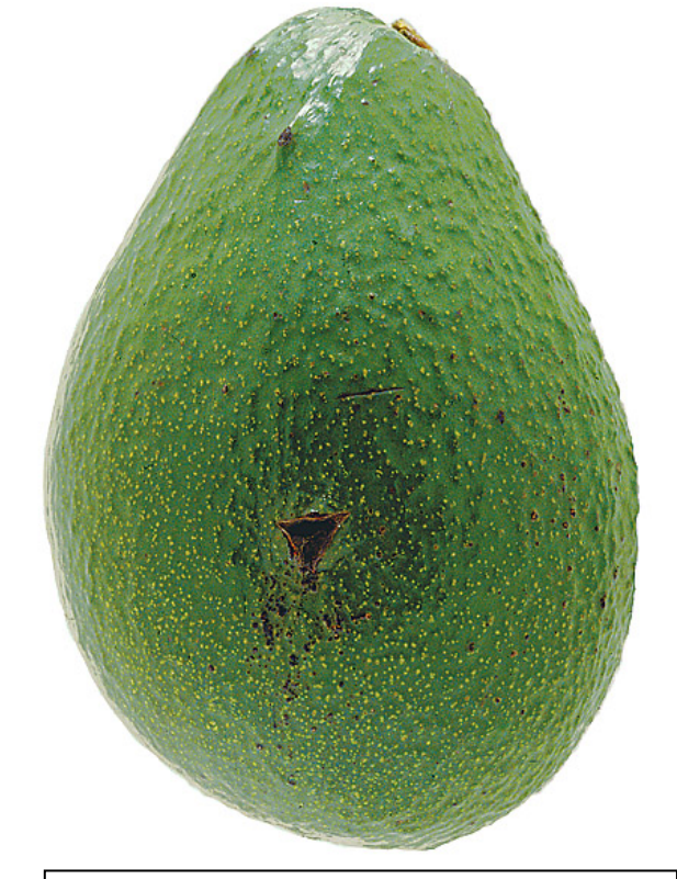
Above: Fruit fly stings